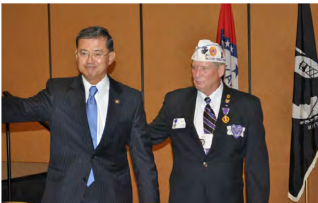
Secretary of Veterans Affairs Eric K. Shinseki spoke during the opening reception and meeting at this year's Military Order of the Purple Heart 81st Annual National Convention in Rogers, Ark.